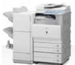
Canon iRC 2880i