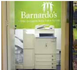
The Canon CLC3200 Multifunctional Colour Printer