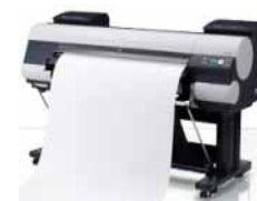
High-speed, high-precision plotters

Our wide range of printers include every type imaginable, from the small desktop version to the large wide format poster printer and includes business card printers and even the desktop multifunctional all-in-one products.